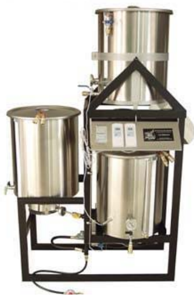
B3 Model 2050

One thing that should make the beers interesting is we will be using two radically different brewing methods. Half the beer will be made on a Beer, Beer, and more Beer 21 st century HERMS system. Pumps, thermostats, floats, and lots of other labor saving devices. All will be turn key and automatic. If you want to see one of these beauties in action, here is your chance.